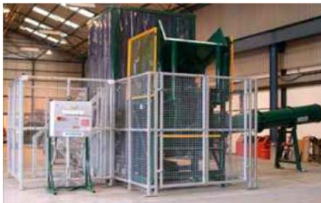
Complete revolution™ 2000 series system installation with control panel, safety guarding, pallet tipper and lift equipment

Processors are currently available in three sizes with custom options to satisfy specific end-user requirements such as enlarged hoppers, bin-lift and pallet tipper feed apparatus.