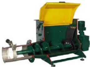
Cut-away sectional view of revolution™ 400 series compaction unit showing patented screw and spring loaded compression cone.